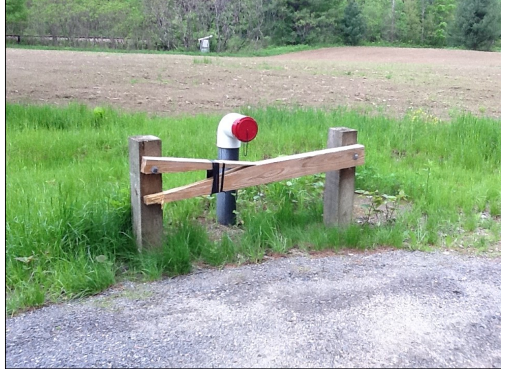
Black tape repairs to standpipe guard damage.

The protective guard in front of the standpipe has been damaged but a resourceful Vermonter has repaired it with black tape. Duct