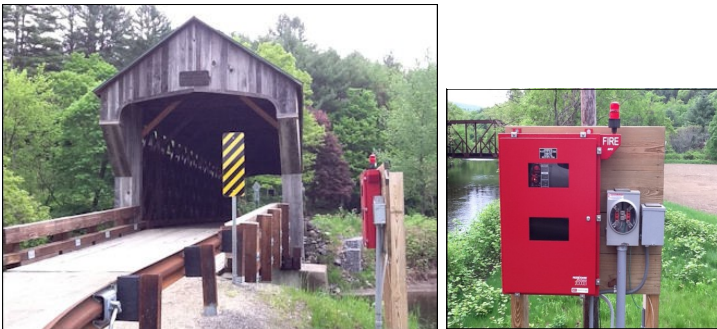
The new fire alarm system is installed, but no meter.

May 24, 2011- Worrall Bridge [45-13-10] The new fire alarm system is installed - note the absence of a watt-hour meter. My guess is the select board hasn't come to terms with the arrangement where they are to pay the electric bill to protect the million dollar restoration investment.