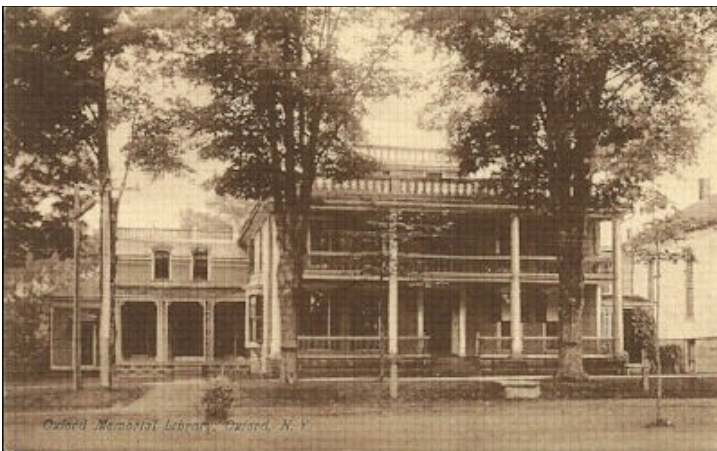
Oxford Memorial Library – circa early 1900's

Come - Join Us! - The tent's been ordered, the speakers have responded, the band is warming up and sunshine has been requested, all in preparation for the grand opening of the Theodore Burr Covered Bridge Resource Center on Saturday, July 2, 2011. The celebration committee has been