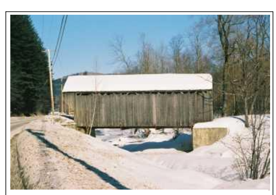
Giorgetti Bridge, Pittsfield, Vt. (45-11-B2) 1978 stringer