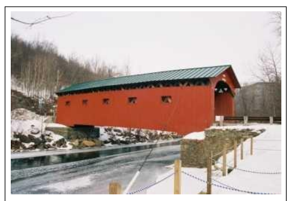
West Arlington Bridge (WGN 45-02-01)

Since I had scheduled a sleigh ride at Mt Top Inn in Chittenden for 4pm Saturday, my wife (also a photographer) and I headed down Route 118 to Route 100, to Interstate 89 then Route 107 to Route 100 and into Rutland from Route 4. Since the sleigh ride was our priority and having photographed all the bridges along