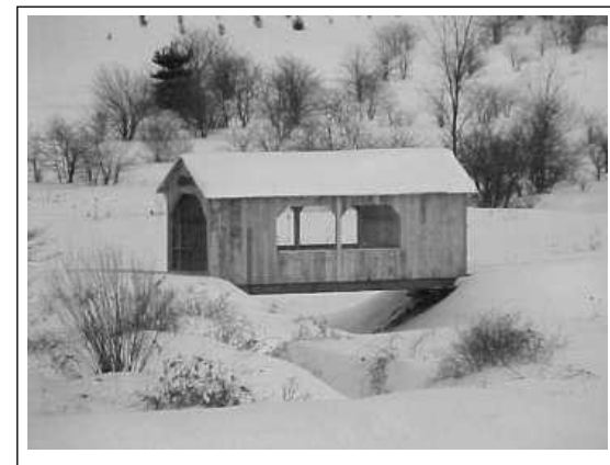
New "Romantic Shelter" Here is a bridge built last fall for snowmobilers. By the looks of it when we took the pictures, it's well served its purpose. It's over a small creek in an open lot off Rte 8 just north of the Rte 12 exit south of Holland Patent, NY. - Janet Corby

Calhoun-Burns and Associates, a West Des Moines engineering firm, will design the bridge, which will replicate the old one as accurately as possible.