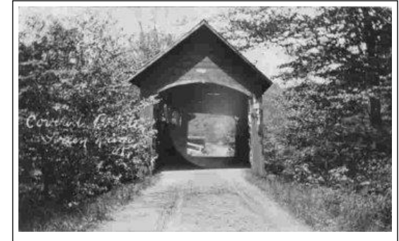
The Other Green River Bridge - old postcard

One span "far from the maddening crowd" is Green River Bridge, tucked away in a remote corner of Guilford in southeastern Vermont. Ed Barna summed it up best by describing this as, "a Vermont classic." Whichever route you choose to travel, this 1873