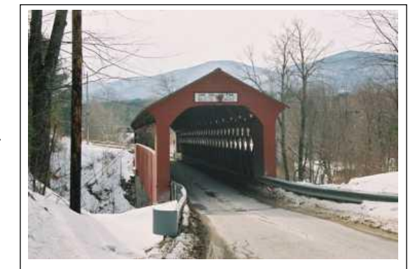
East Arlington Bridge (WGN 45-02-05)