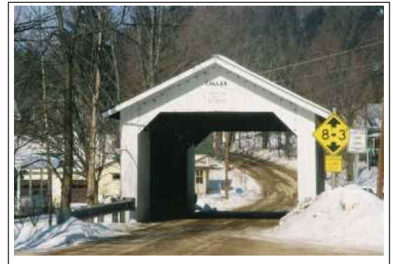
Fuller Bridge - Montgomery, Vt. (WGN 45-06-05) See article "My Weekend Trip"