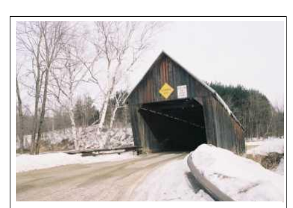
Lincoln Bridge, West Woodstock, Vt. (45-14-13)