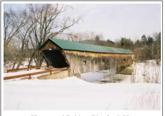
Hammond Bridge, Pittsford, Vt. (45-11-05)