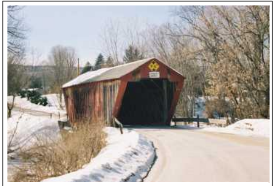
Cooley Bridge, Pittsford, Vt. (45-11-07)

A final note. To view other photographs of my Vermont bridges, check out the website: vtonly.com, scroll to covered bridges, winter bridges are all mine or click on other bridge sites while there and my photographs are identified with my name. Hope you visit the site and enjoy the photographs.