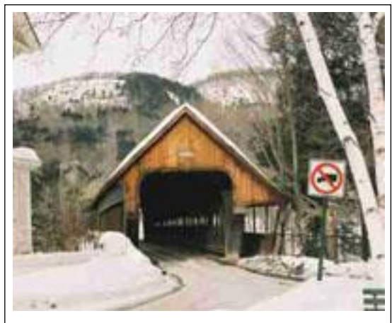
Middle Bridge, Woodstock, Vt. (45-14-15)