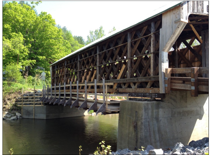
Worrall Repairs May 2012

The Daniels construction company continues to work on repairs to the recently renovated Worrall Bridge. It had an unfortunate meeting with the roof of the neighboring Bartonsville bridge when Irene swept it downstream.