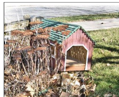
Spade Farm Bridge Model

Bill Caswell presented a power-point showing of bridge damage to numerous Vermont covered bridges as well as a few in adjacent states resulting from the August 2011 deluge from Tropical Storm Irene.