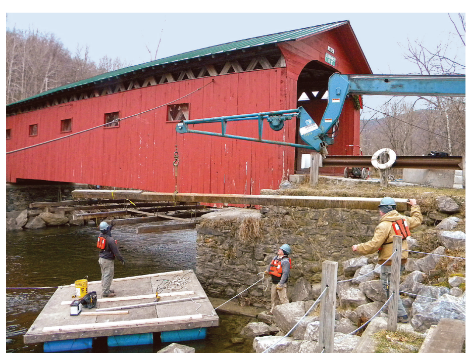
On January 25, 2012, the three-man crew from Wright Construction was hard at work, using a raft to serve as a temporary platform from which to hang scaffolding under the bridge. The damage inflicted by Tropical Storm Irene the previous August was apparent (below) in the outward bow in the downstream side of the bridge.

Among the survivors—each known today for some special quality, unique aspect of construction, remarkable location, or some small quirk of fate that has led to its ultimate survival—are the Green River Bridge, which has a post office drop box inside it; the