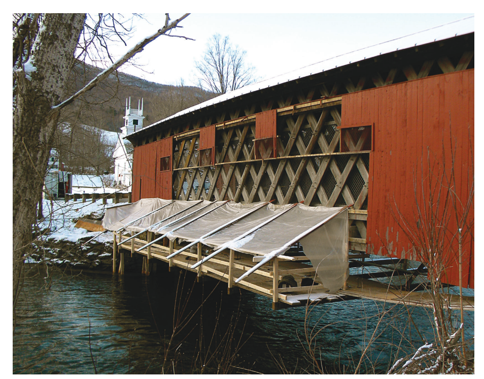
By January 30, parts of the bridge siding had been removed to gain access to the trusses and chords of the bridge. Plastic was used to cover scaffolding and provide protection from the weather as work progressed both under and on the upstream side of the bridge.